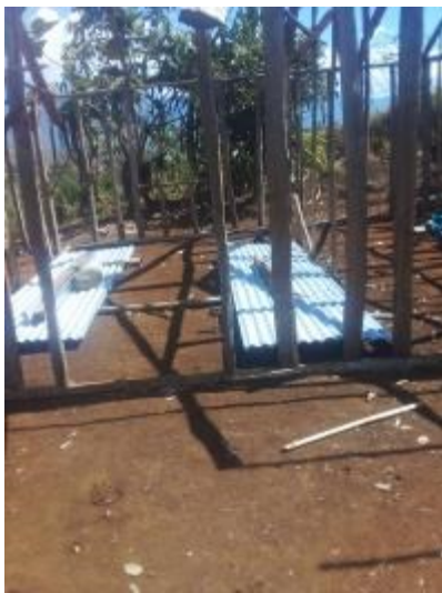
Ready to roof a Building for water to go to the Tank