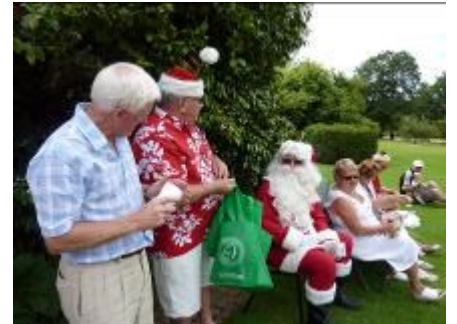
RCMM Christmas Party 2010