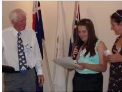
Junior Community Awards 2010