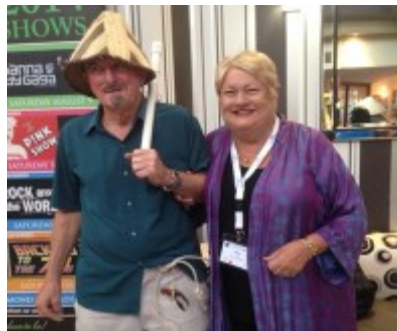
Bendigo Conference 2014 Chinese Theme Night