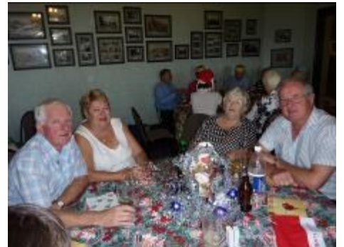
RCMM Changeover 2017