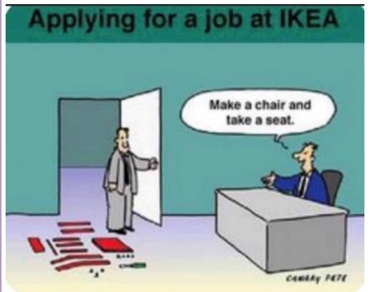
Ikea job interview