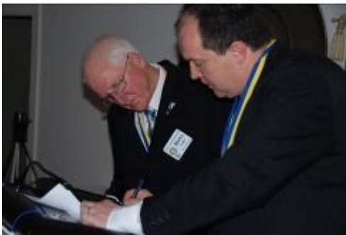
RCMM Changeover 2011