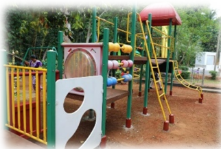
Memorial Drive Reserve; Noble Park, Victoria

Rotary Club of Colombo: Kohombiliwela Buys Home, Matale, Sri Lanka.