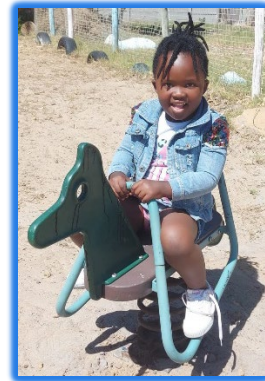
Cape Town, South Africa Loading at Mount Martha.: ZAN – Dandenong City – Sandra Reserve