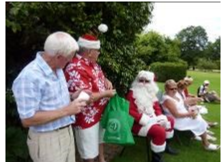
RCMM Christmas Party 2010