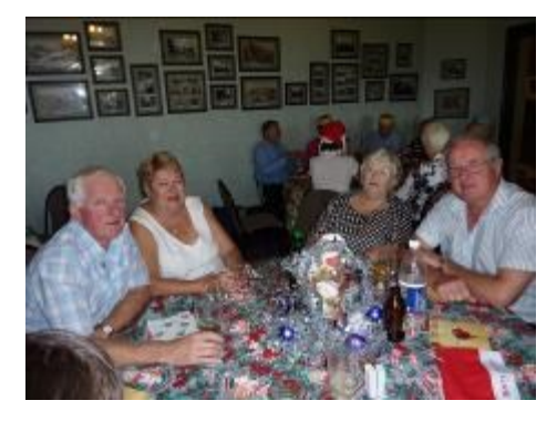
RCMM Changeover 2017