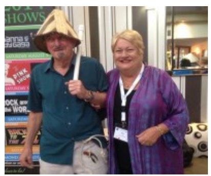
Bendigo Conference 2014 Chinese Theme Night