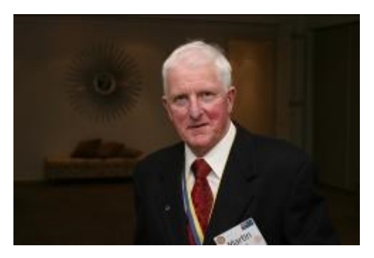
RCMM Changeover 2009