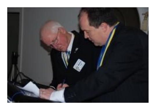
RCMM Changeover 2011