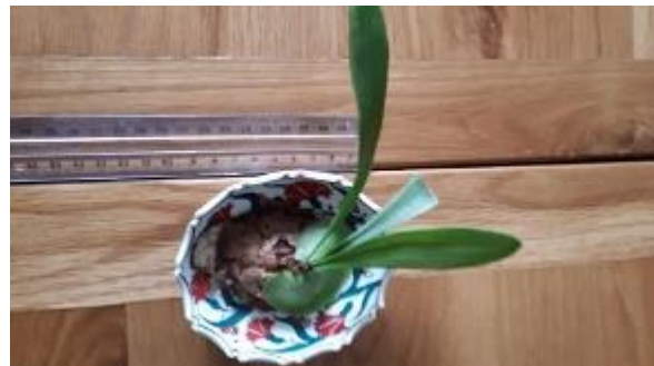
Stag 2020 3y 6mths 8cm