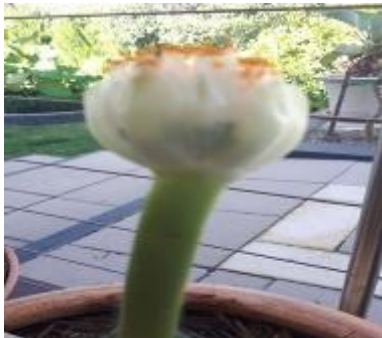
Haemanthus White 2020